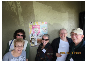
Lunch Mexican Village